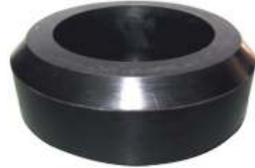
Packer Elements Nitrile Downhole